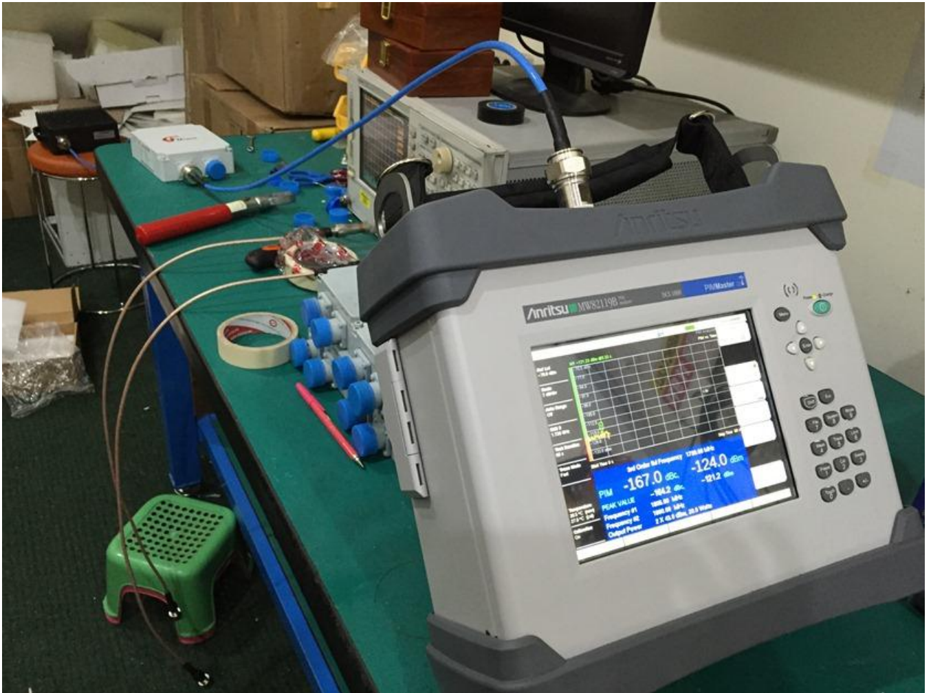
Anritsu PIM Master MW 82119A